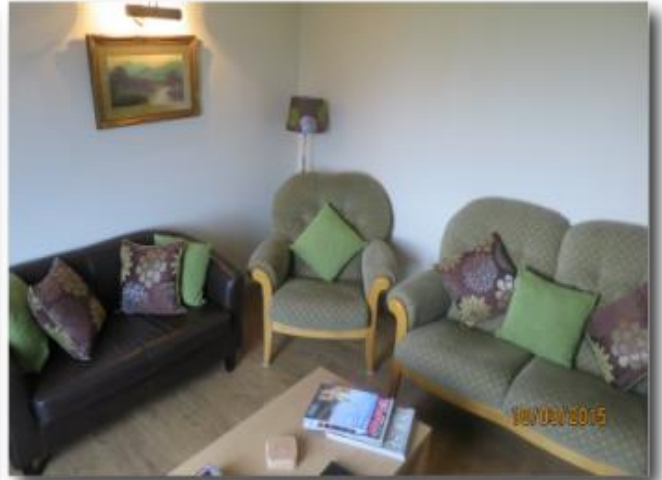
Forge lounge area