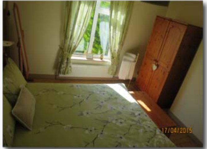
Forge bedroom two – first floor