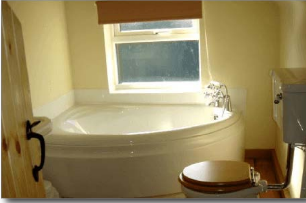
Forge corner bath – first floor