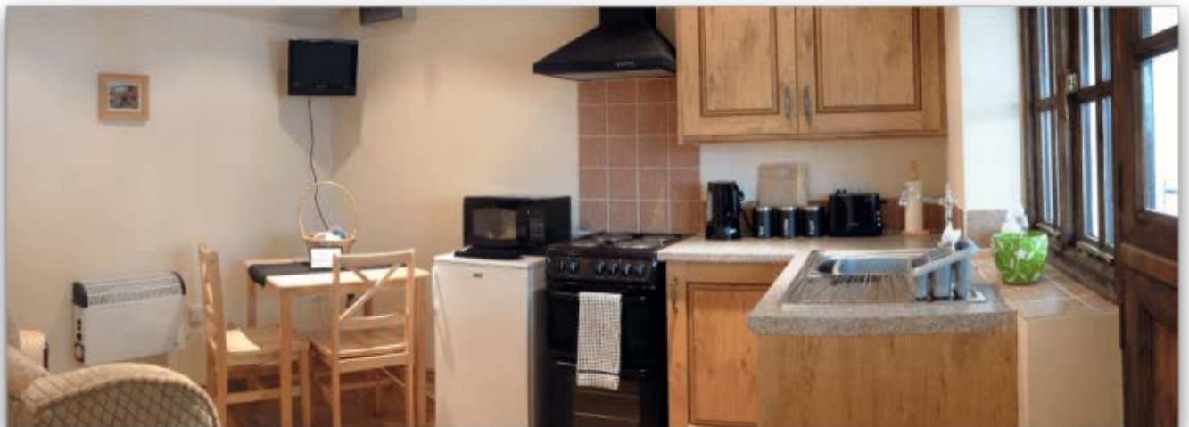
Smithy kitchen/dining area