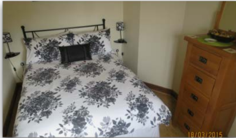
Smithy has ground floor bedroom