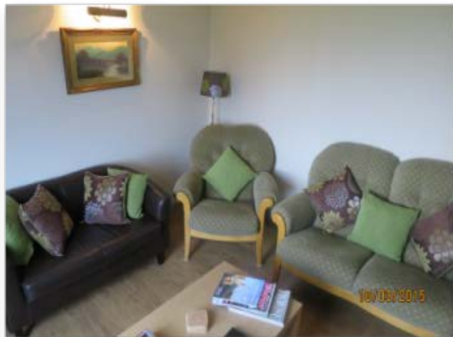
Forge lounge area