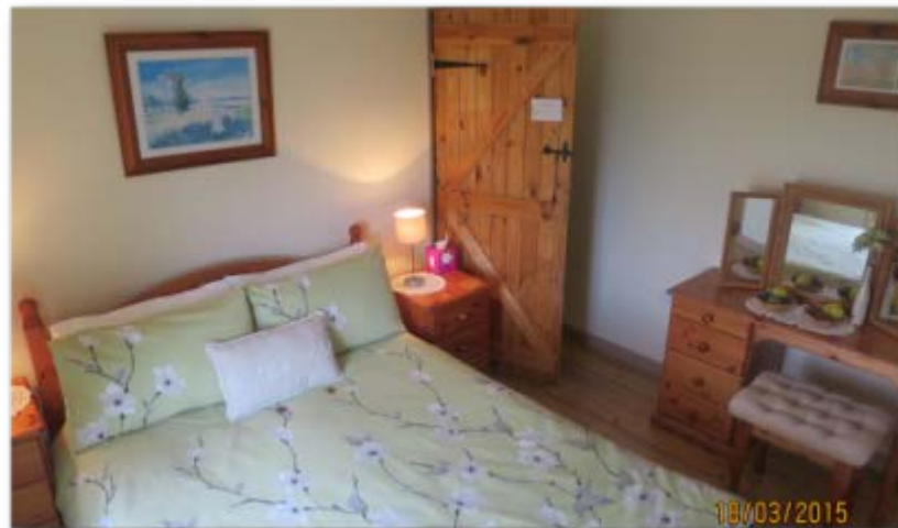
Forge bedroom one – first floor