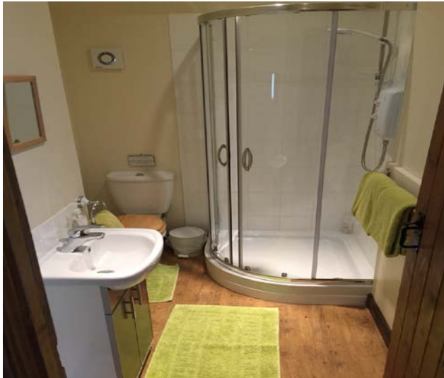
Smithy shower room