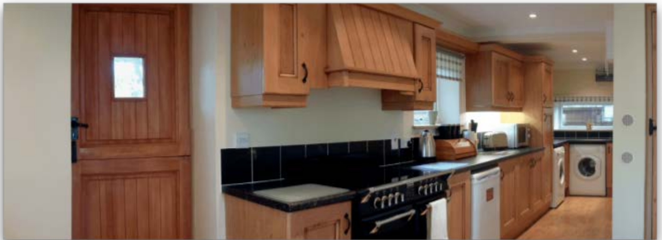
Forge kitchen area